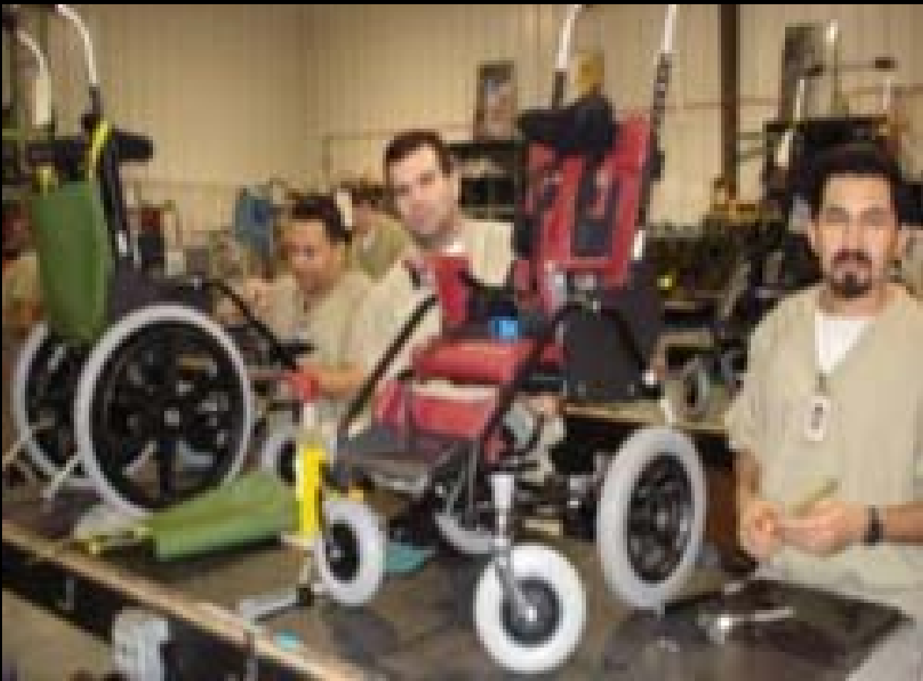
Inmates from the South Dakota State Penitentiary Manufacturing the ROC Wheelchair.